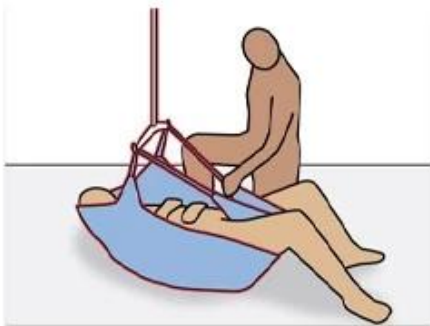
Lifting from floor