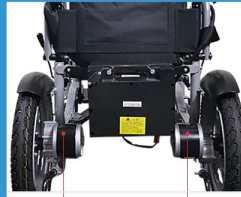
Motor 1 Motor 2 500W dual motor, DC motor /strong climbing ability