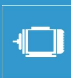
500W dual motor