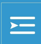
Easy to fold