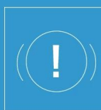
EABS Brake system