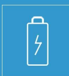
High battery life