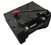
Carbonic acid battery Driving distance is about 12km