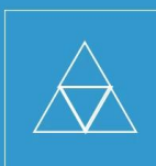
Carbon steel material